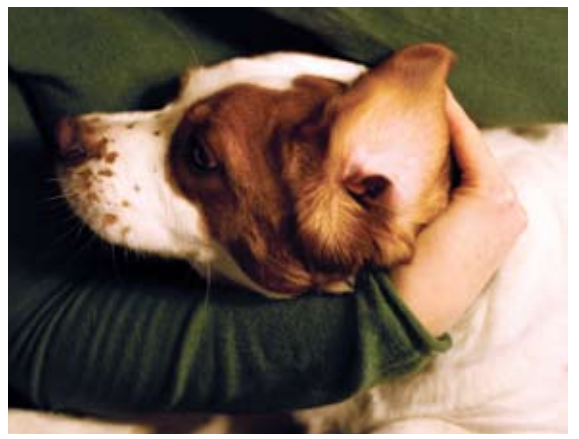
Use one hand to hold the ear flap back so that you can treat the ear with the other.

you stand behind it. Sometimes it helps to back the pet into a corner.